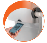
BUILT IN CAMERA FOR QR CODE